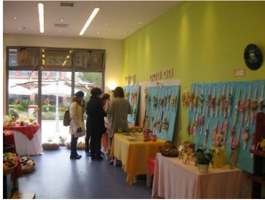
ALMA - Easter Bazaar

The Easter Bazaar of the ALMA, Panhellenic Association of Adapted Activities, was held at Flisvos Marina from 28th to 29th March 2015, with the twofold purpose of fund aid by selling Easter items and informing visitors about the aims of the Association.