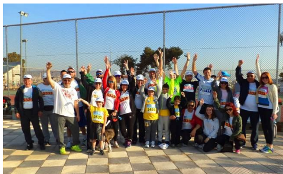
Poseidon Half Marathon

On April 4 th , 2015 the Easter Bazaar by the non-profit organization “Lovekids”, supporting children aged 3 to 16, whose families are unable to provide them with the necessities, was held for the purpose of strengthening its mission.