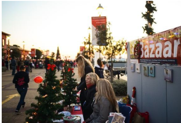
ALMA - Christmas Bazaar

On December 13 th , 2015 the Christmas Bazaar of the ALMA, Panhellenic Association of Adapted Activities, was held at Flisvos Marina. The revenue from the Bazaar was used to further the continuation of the programs for disabled children in Paleo Faliro.