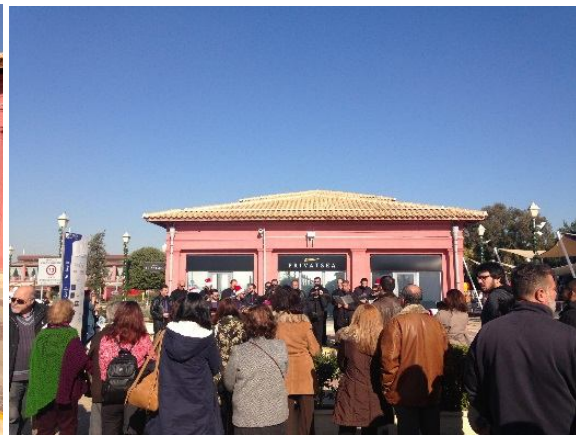
"Saint Alexander's" Choir

On December 19 th , 2015 a music event was held by Saint Alexander's Choir in open space with religious and Christmas music selections in order to entertain marina's visitors.