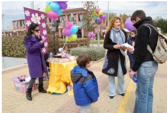
Lovekids - Easter Bazaar

The Easter Bazaar of the ALMA, Panhellenic Association of Adapted Activities, was held at Flisvos Marina from 28th to 29th March 2015, with the twofold purpose of fund aid by selling Easter items and informing visitors about the aims of the Association.